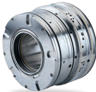
RoTechSeal - maximum robustness against contamination