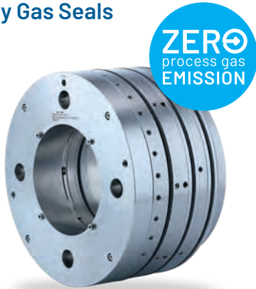
CobaDGS - Zero Emission Solution