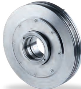
CSR - contacting bushing seal