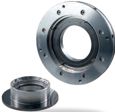
CobaSeal - maximum protection against bearing oil