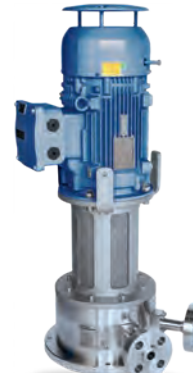
Maximum protection against DGS contamination with process gas